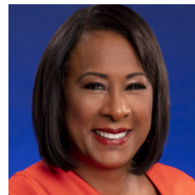
Pat Harvey CBS2/KCAL9