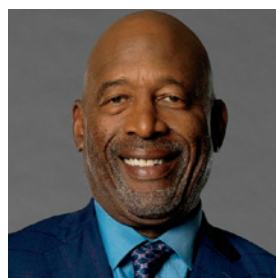
James Worthy Governors Award