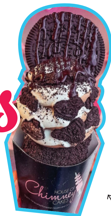
House of Chimney Cakes Loaded cake? Yes, please!

When your sweet tooth is calling and you want something extra special, look no further than these unique desserts in metro Detroit.