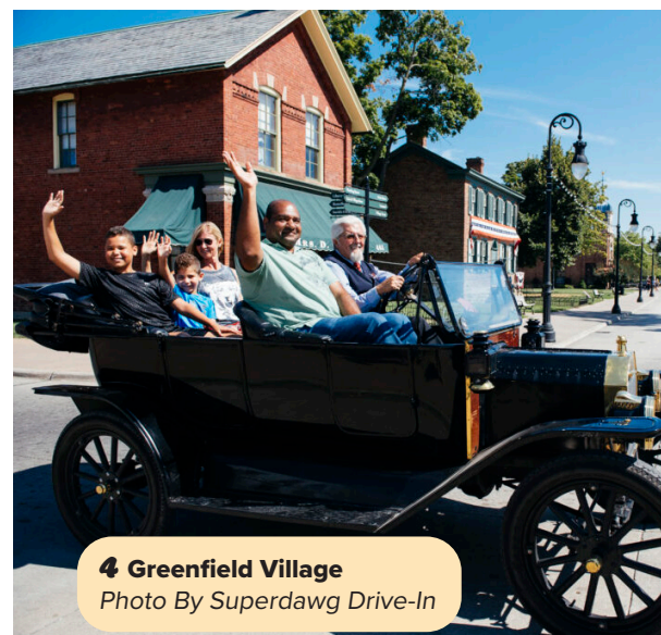
4 Greenfield Village

3 Discover Detroit's history at The Henry Ford Museum of American Innovation , featuring the Rosa Parks bus, Kennedy Limousine, antique cars and rotating exhibits.