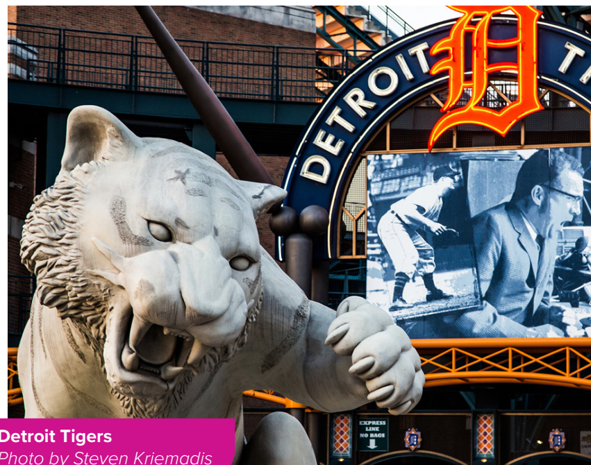
Detroit Tigers