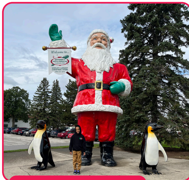
1 Bronners

Visit the Heidelberg Project, open daily 8 a.m.-7 p.m., where Tyree Guyton turned abandoned homes, broken cars and trash into art.