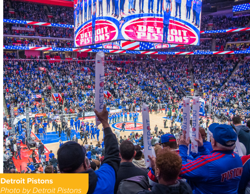
Detroit Pistons

Fuel up for the game at Pride Plaza with food trucks and grown up beverages, and enjoy football-themed games and activations, photo stations, a drumline performance and more.