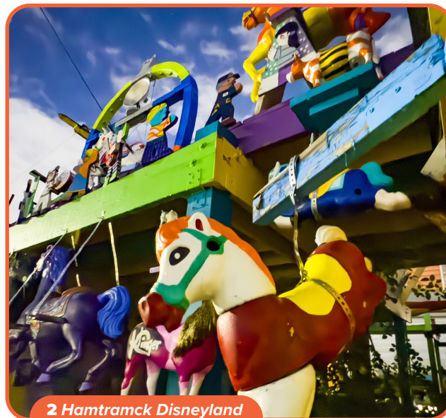
2 Hamtramck Disneyland