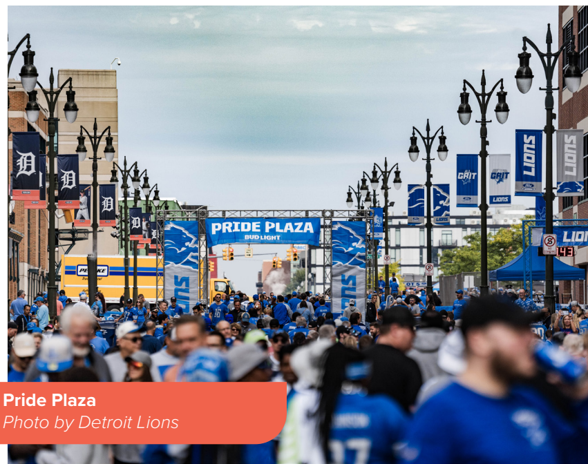
Pride Plaza